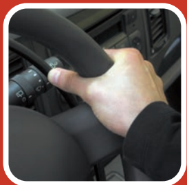
C. Pushing the gasring with the thumb from the inside of the steering wheel.