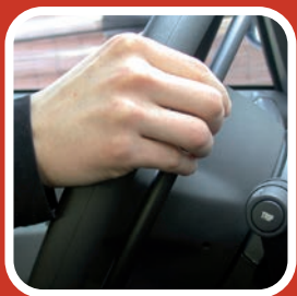
A. Pulling the gasring towards the steering wheel.

These devices help all those drivers who lack lower limbs mobility to drive vehicles equipped with automatic transmission or automatic clutch. Both devices are located under the original steering wheel: the accessibility to the vehicle and to the original controls is therefore not hindered in any way and the design of the cabin remains unchanged. The exclusive “cut” shape of the new easy-fit gasring has a double functionality: it increases the space between the gasring itself and the driver’s legs, avoiding the risk of damages, and it allows the installation on the majority of vehicles available on the market, including those equipped with a “sports wheel”. K5: allows the acceleration both by pulling the ring towards the steering wheel and pushing it towards the dashboard. The user can change his driving style according the road conditions. The various accelerating modes with the K5 are: