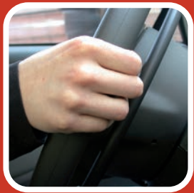
B. Pushing the gasring towards the dashboard.